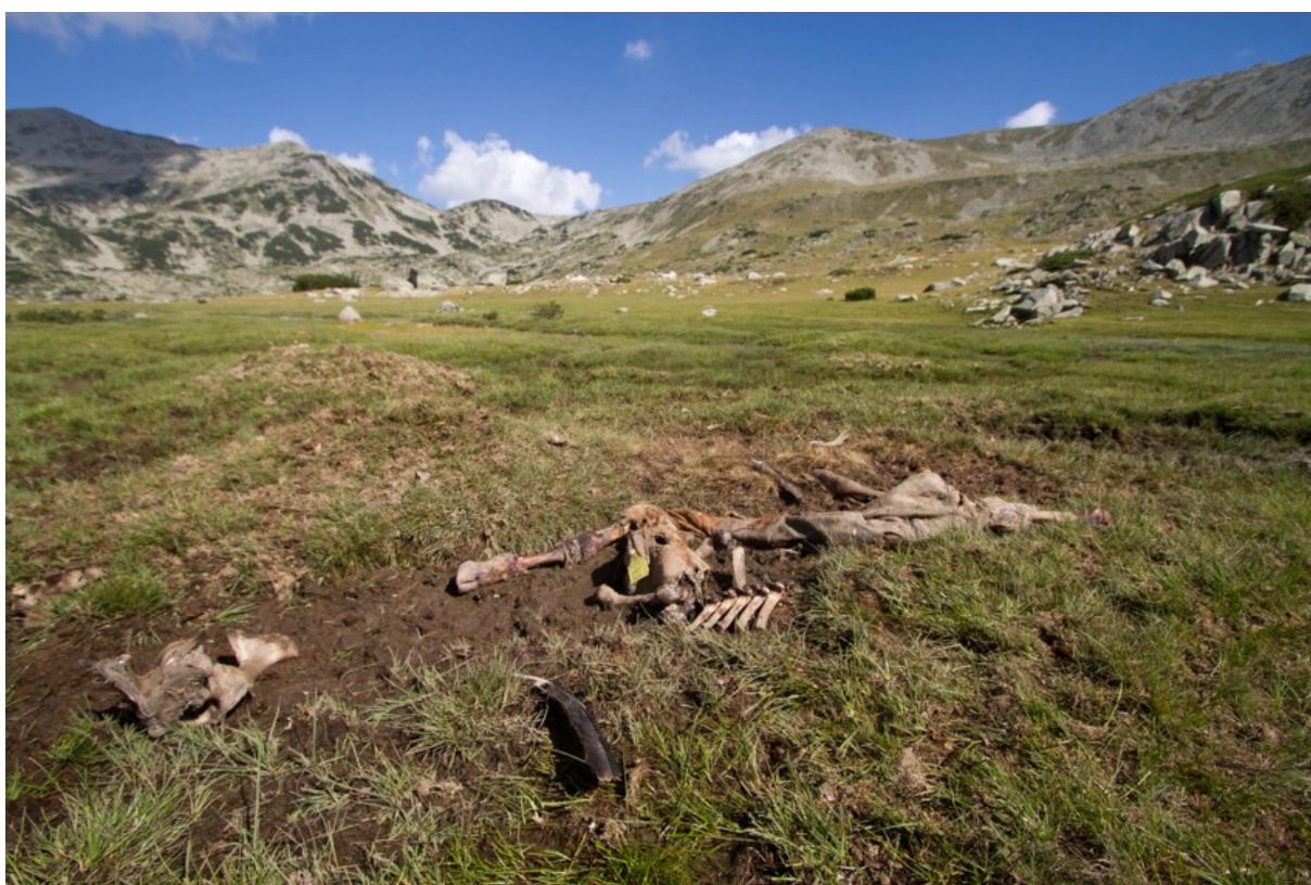
Fig. 4. The remains of a dead cow eaten by the Griffon Vultures in high altitude ~2200 m mountain pastures in Pirin National Park (note the Griffon Vulture's secondary feather in front) (Photo by Hristo Peshev, 11 August 2016).

The current study provides new insight of Griffon Vultures' movements and whereabouts in Southwestern Bulgaria and some specific data about their seasonal presence and numbers in the targeted Parks' territories.