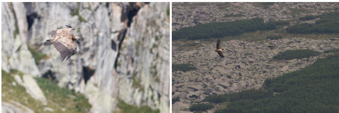
Fig. 2 (left), Fig. 3 (right). Griffon Vultures in high altitude ~2400 m mountain habitat in Pirin National Park (Photo by Hristo Peshev, 11 August 2016).